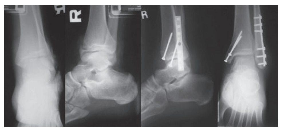
Fig. 2: Preoperative and post-operative plain radiograph.

Motor vehicle accident (MVA) was the most common cause of ankle fractures (70.4% of all study subjects) (Figure 1). In young, active people, fractures were associated with vigorous activity, especially sports (6.2%). Other causes include falls, especially in elderly (8.6%). Among the MVA cases 45.7% were motorcyclists and 1.2% were lorry drivers.