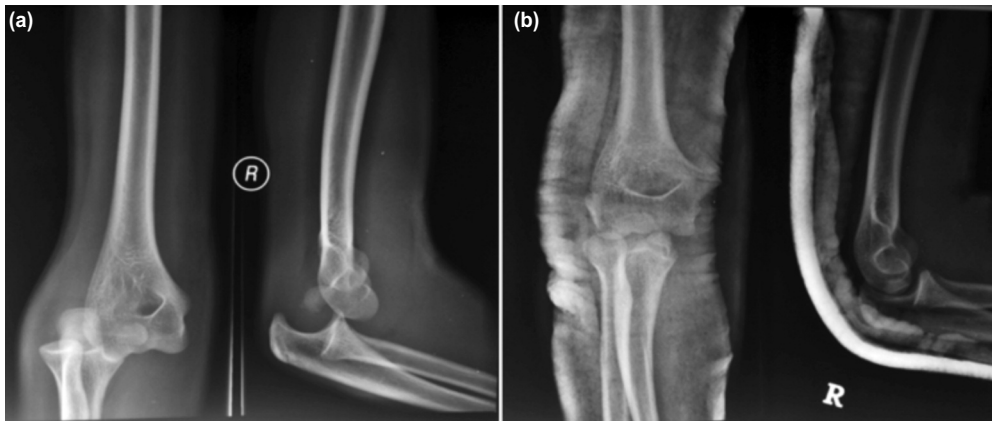
Fig. 1: (a) Right elbow radiograph showing right posterolateral elbow dislocation with intraarticular entrapment of medial humerus epicondyle avulsion fracture fragment in the elbow joint. (b) Medial humerus epicondyle fracture fragment remained entrapped in the elbow joint after closed manipulative reduction.