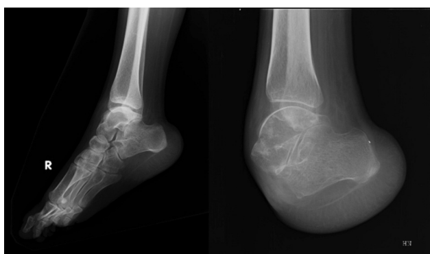
Fig. 3: Preoperative and postoperative radiographs of right foot.

(1:320) with a homogenous pattern; Anti ds DNA was positive with a titre of 800 IU/ml. C3 complement level was 73, and C4 complement level was 11. Antibodies to Cardiolipin (IgG and IgM) and phospholipase A2 were negative. Plain radiographs of feet and leg were normal. Arterial Doppler showed monophasic waveforms in both arteries. CT angiography of both lower limbs showed thrombosis of popliteal arteries with reformation below trifurcation. In the right leg, there was no contrast opacification in anterior, posterior tibial and peroneal vessels. In the left leg, there was faint contrast opacification in all the three vessels (Fig. 2b).