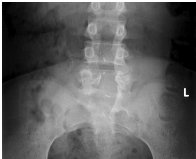
Fig. 1: Anteroposterior view of lumbosacral spine showing L4-L5 spina bifida.