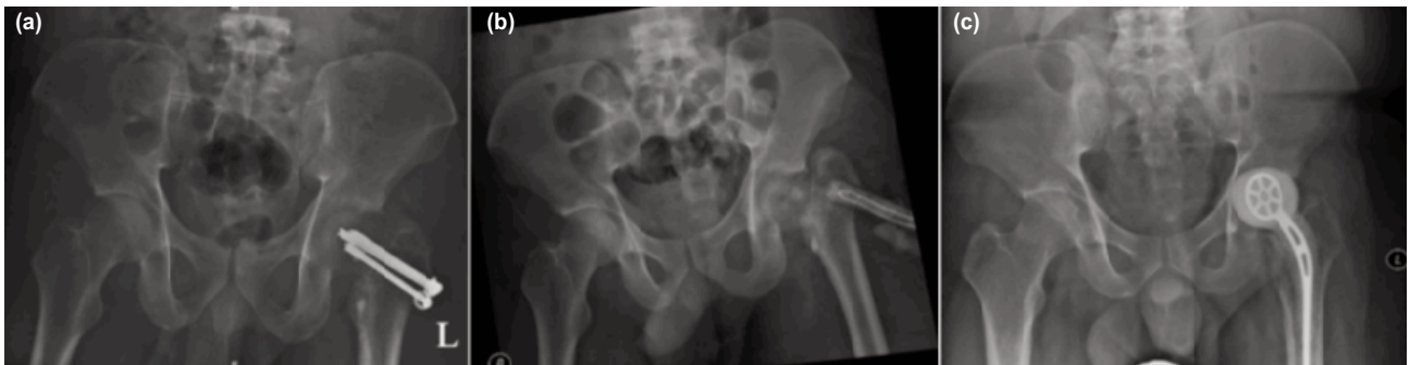
Fig. 2: (a) On admission, radiograph showed femoral osteolysis surrounding the femoral neck screws with osteomyelitic changes of the femoral head, (b) Radiograph taken immediately after removal of implant(ROI) and insertion of antibiotic rods. Femoral neck collapsed and shorten after ROI and (c) A week after initial debridement, antibiotic-laden left hip spacer with metallic skeleton was inserted.