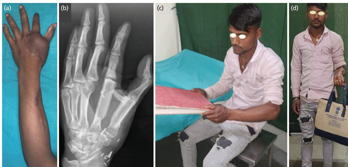
Fig. 3: (a) Follow-up image showing a well-settled flap. (b) Follow-up radiograph showing fibular bone segments resembling metacarpals without bony resorption after six months. (c) Patient holding a book (Power grasp). (d) Patient lifting a bag (hook grip).