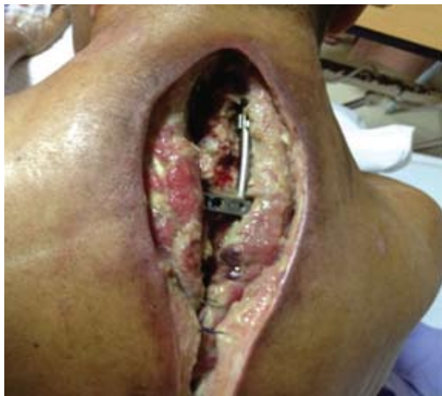
Fig. 1: Wound breakdown with exposed implant over the cervico- thoracic area.