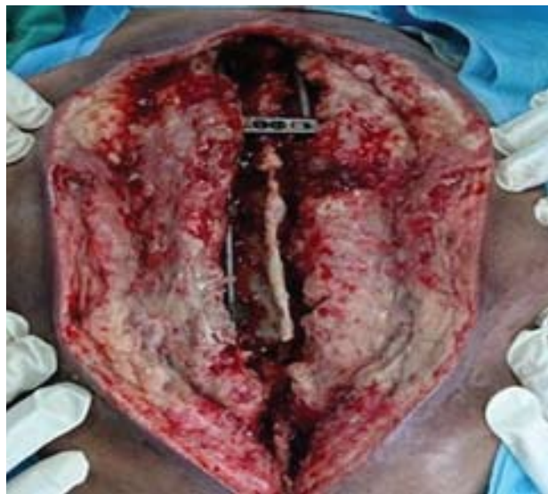
Fig. 2: After 1st wound debridement over cervico- thoracic region with exposed implant.