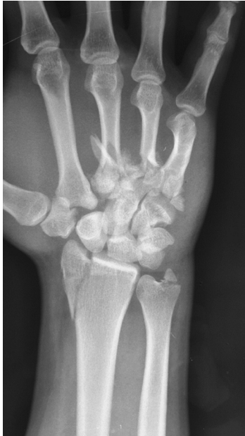
Fig. 1: Radiograph shows the injuries of patient's right hand.