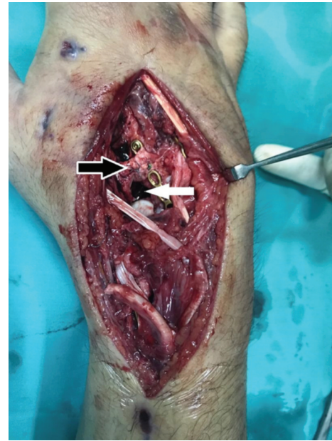
Fig. 2: Black arrow shows that the ECRL is folded in anchovy-like fashion. White arrow shows the void which is to be filled with the folded ECRL.