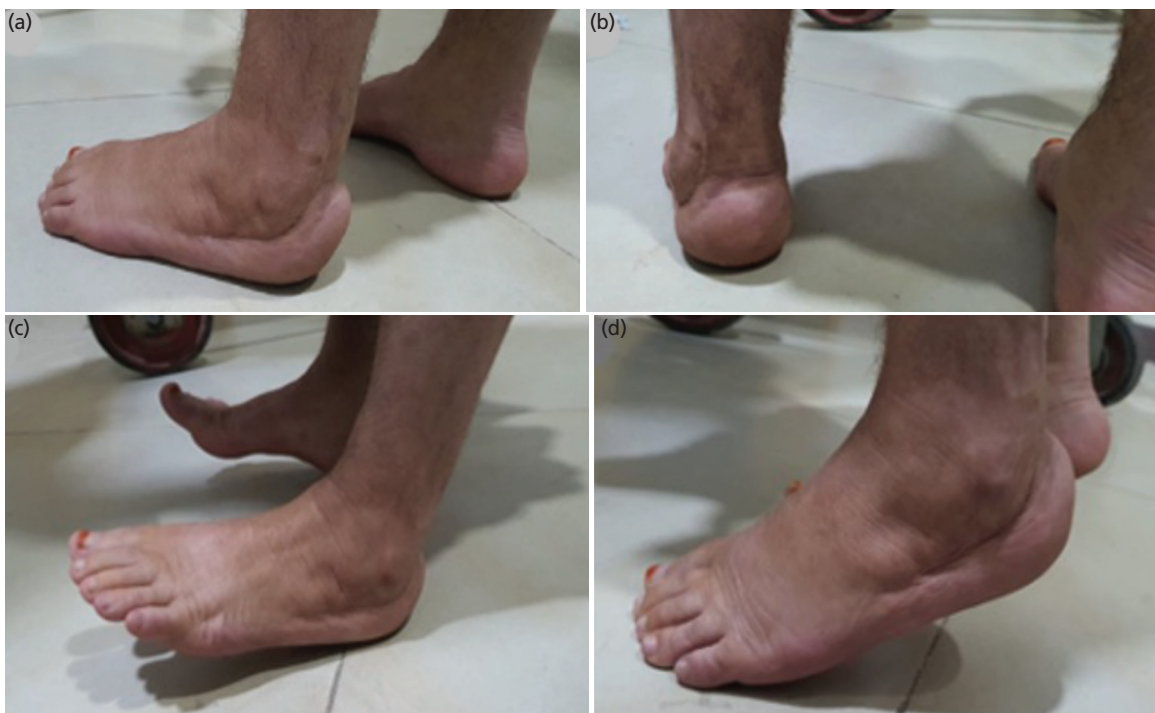
Fig. 3: Clinical photograph at 36 months' post-surgery, (a and b) showing a mature scar with plantigrade foot, and (c and d) patient being able to stand on heels and tip toe.