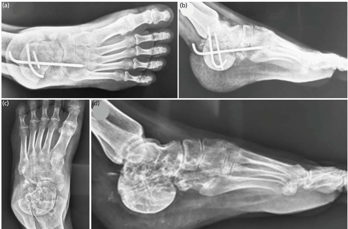
Fig. 2: (a and b) Follow-up radiographs at three months showing early radiological signs of graft incorporation. (c and d) The 36 months follow-up radiographs (AP lateral radiographs), showing complete incorporation of allograft, no local recurrence and resorption, with some alteration in calcaneal pitch angle.