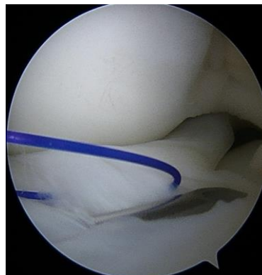
Figure 2: Anterior horn tear - repaired