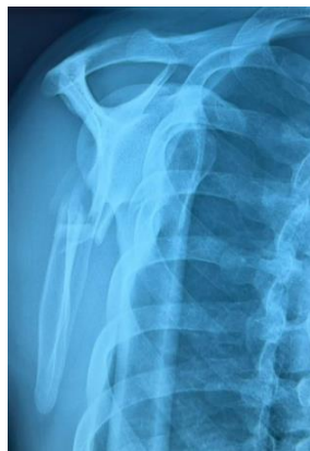
Figure 1: Superior approach of glenoid

intraoperatively, right shoulder able to flex until 180 degree. Patient was discharged well & advised with pendulum exercise.