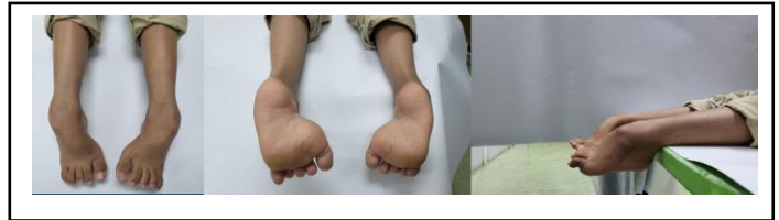
Figure 1: Foot deformities at presentation

post-operatively. The foot deformities were corrected and she was able to resume her normal daily activities.