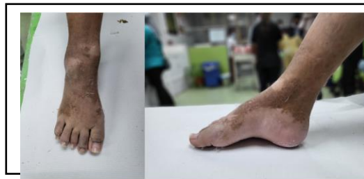
Figure 2: Right foot after serial casting