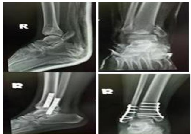
Figure 2: pre and post op plain radiograph