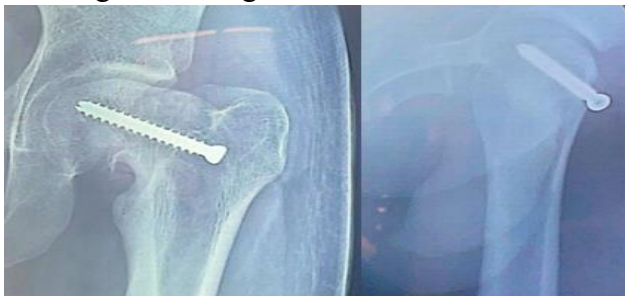
Fig 1: Pre operative x rays

An 18-year-old male with post-traumatic left hip slipped capital femoral epiphysis (SCFE), complicated by hip coxa vara and limb length discrepancy, resulting from a fall four years earlier. The patient underwent screw fixation then. Due to continued deformity and eager to return to sports, the young patient underwent valgus derotation and deformity correction using Limb Reconstruction System (LRS) for lengthening and realignment. Post operative follow up delightedly showcased patient with unhindered ambulation with promising radiological findings.