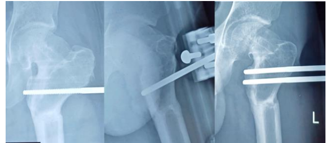
Fig 3: Follow up X Rays, showing callous