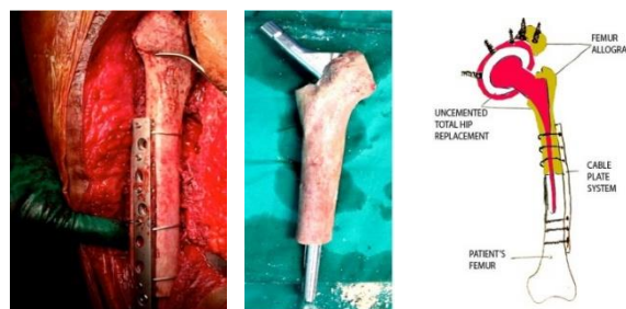
Figure 1: Picture and diagram showing allograft-prosthetic composite technique.

was secured with a cable plate and remaining allograft known as “kebab” technique.(Figure 1) . X-ray post-operative as shown and patient has good range of movement post fixation with no limb length discrepancy. It is still early to tell the surgery is successful. However, as our vigilant 3 months post- operative follow up there is no sign of infection and patient already ambulating with crutches.