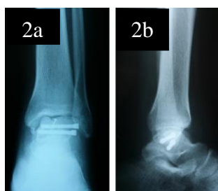
FIGURE 2: Postoperative X-ray