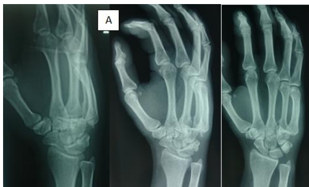
Figure A shows the plain radiographs of the affected right wrist.