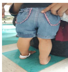
Figure 1 : Day3 No residual abnormality