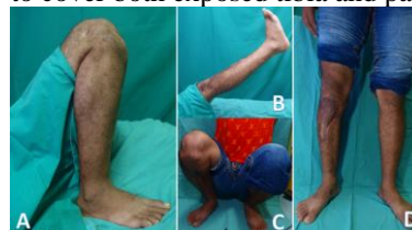
Figure 3 (A-D) : Good functional outcome on follow up 5 months post trauma with full range of motion knee flexion and extension