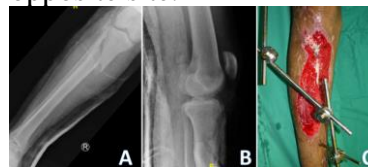
Figure 1: Injury (A) anteroposterior and (B) lateral radiographs demonstrating comminuted fracture of proximal third right tibia. Exposed tibia bone and patella tendon (C)

aesthetic appearance. The patient also regained full knee range of motion, comparable to opposite site.